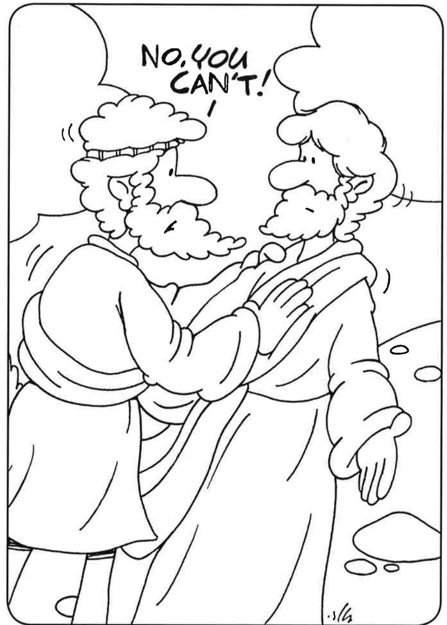
Peter took Him aside and began to rebuke Him. Matthew 16:22